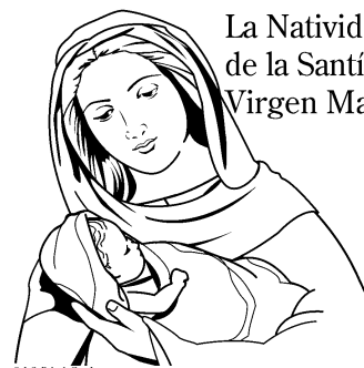
La Natividad de la Santísima Virgen María

Reunión de Padres de Familia: El domingo, 7 de septiembre de 2014 a las 11:30am en el Auditorio para los padres de familia de alumnos desde Kindergarten hasta Middle School.